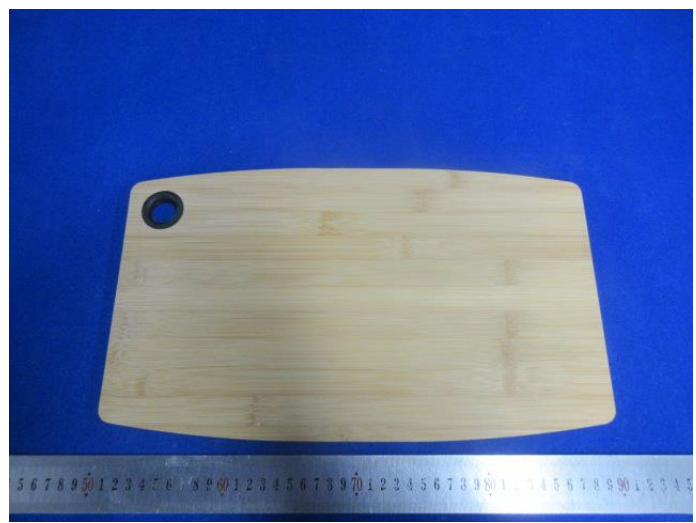
***************** End of Page **************