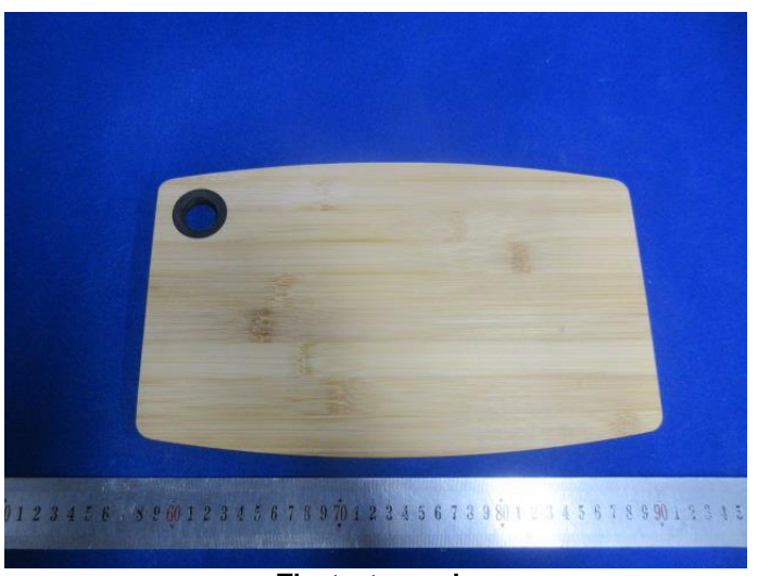
The test sample

测试样品由客户送样委托检测:样品信息由客户提供并确认以下条款仅针对中国市场和社会: